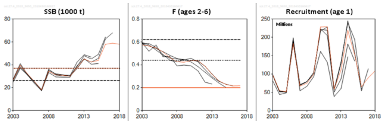
Figure 2 Sole in Subarea 4. Historical assessment results (final-year recruitment estimates included).

In 2017 the fishery exploitation pattern has shifted towards targeting younger fish than in previous years. The forecast assumes an average exploitation pattern over the last three years, which may render the forecast marginally optimistic. This potential change in exploitation pattern will have to be confirmed next year to understand whether this represents a real change in targeting.